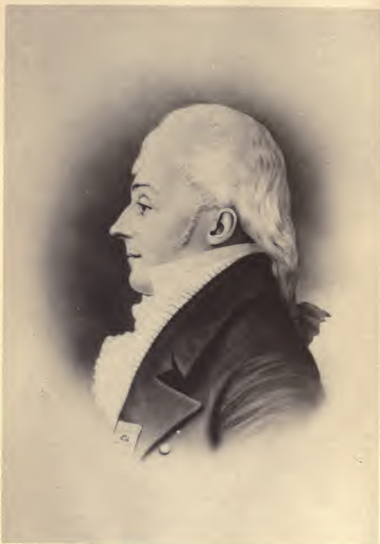
MAINE DE BIRAN.